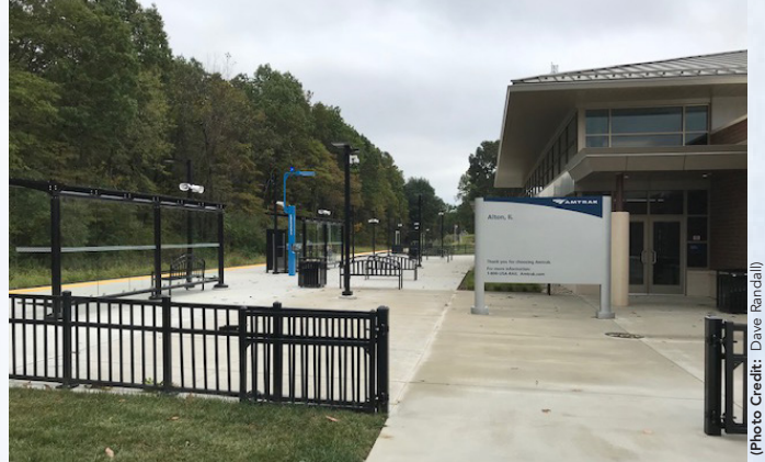
The Amtrak station in Alton, IL

The opening of the Alton station has been a source of importance to the community, but even with all the amenities, there was a problem. The station was only open, 5:00 am - 4:30 pm or the departure of Train