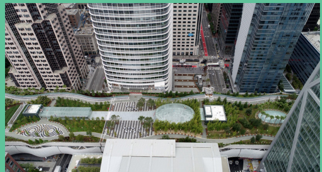
Aerial view of the Salesforce Transbay Transit Center.

2 - Although the Transbay Transit Center is open, only Phase 1 has been completed, which provides bus service for travelers. Phase 2, known as the Downtown