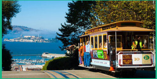
San Francisco cable car.

2 - Of course you'll want to jump on a San Francisco cable car, too. These cars are the only National Historical Monument that move in addition to