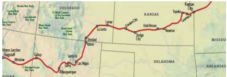
The Southwest Chief's route over the affected section of track in Kansas, Colorado and New Mexico.