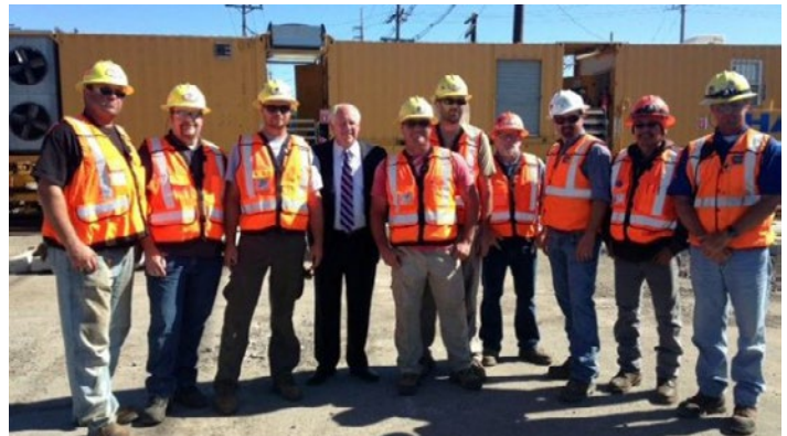
Governor Quinn visiting Granite City to commemorate the replacement of the final tracks and ties for the 110-mph Chicago-to-St. Louis corridor.

The four years of work so far have resulted in hundreds of improved grade crossings along with the addition of four-quadrant and dual gates in several locations. The next step is installing the positive train control