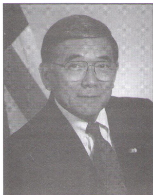
Secretary Norman Y. Mineta

Mineta said he recognizes the crucial role passenger rail will play in the future, stating, "[NARP] has identified one of the most important areas of transportation policy; one that is