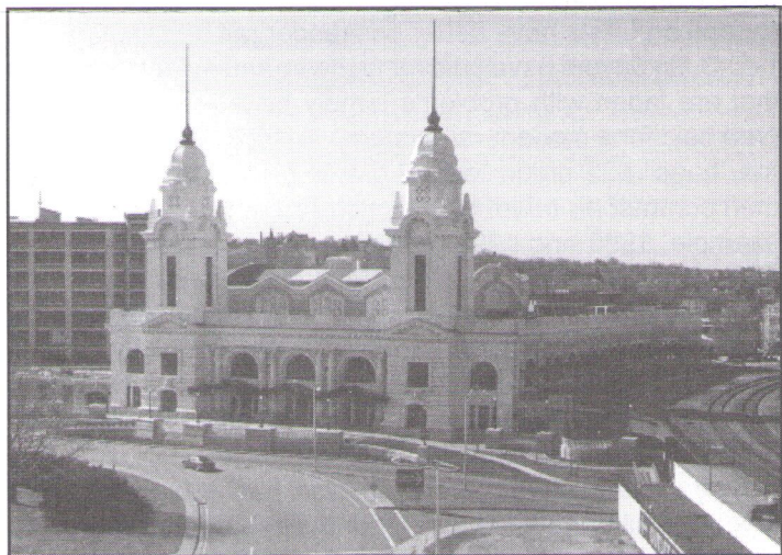
Worcester (MA) Union Station was vacated by Amtrak in 1972, but after a recent renovation, Amtrak will soon return (see Feb. 2001). The station was completed in 1911, but the twin minarets were removed in 1926 (and now rebuilt).